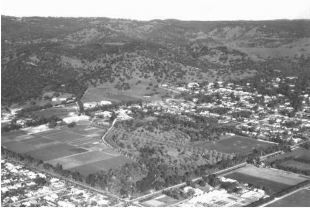
Figure 5: Waite Campus view looking east to the Adelaide hills 1976. The Waite Arboretum is in the centre.