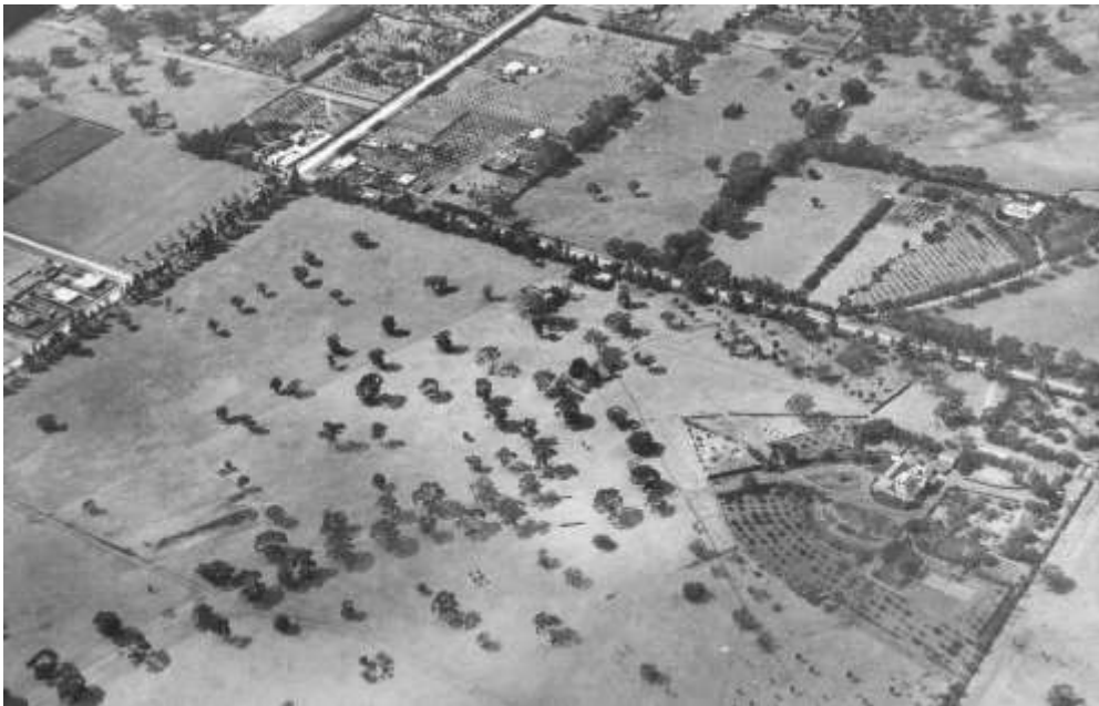
Figure 2: Aerial view (looking east) of the eastern part of Urrbrae estate. Urrbrae House and gardens are located on the right side of the photograph. The photograph was taken by Frank Hurley in December 1919. Source: Courtesy of Marion Wells

In addition, Waite transferred shares to create an endowment fund to establish and run the future institution. The total value of the Waite Endowment was determined to be £100,000. It was one of the most generous public benefactions in the history of South Australia (Zeitz 2014).