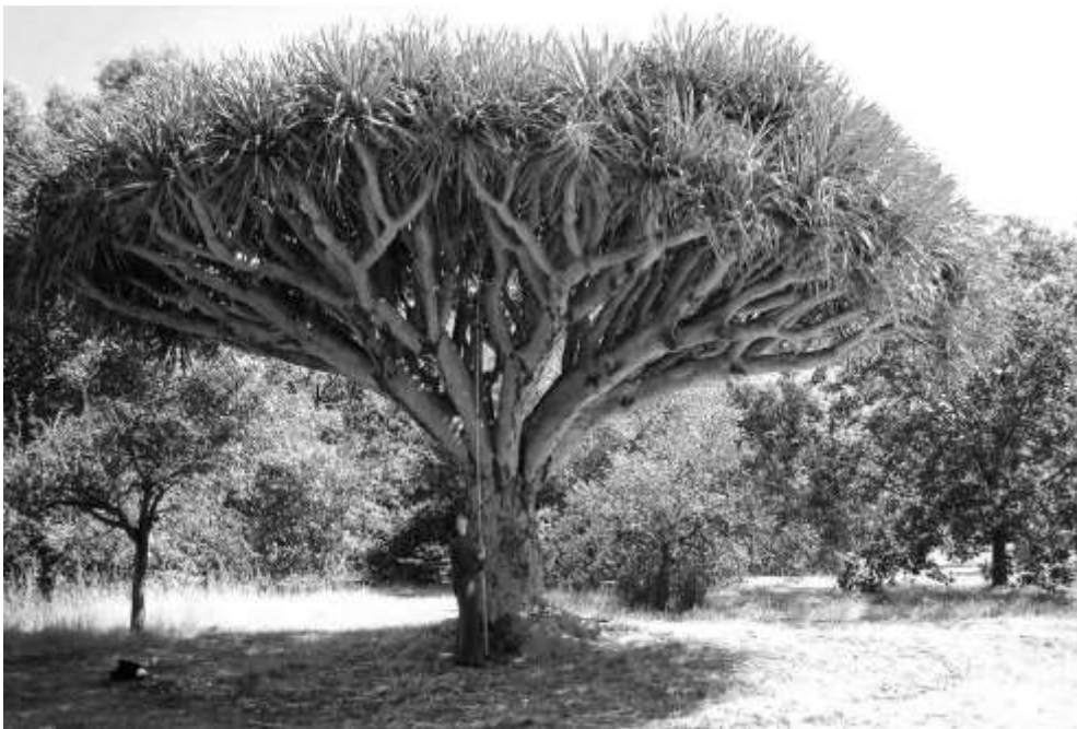
Figure 6: Measuring the iconic Dracaena draco Waite Arboretum Tree #467, November 2002.

Arborescent Dragon Trees ( Dracaena spp.) are represented in the Waite Arboretum with 31 specimens representing five species and one subspecies. Dracaena draco , both the Canary Islands and Cape Verde Islands forms, are common in cultivation (Figure 6). The other species from Socotra (Yemen), Somalia, Oman, Saudi Arabia, Egypt and Sudan are uncommon, but all the Arboretum species are listed in the IUCN Red List, three with Vulnerable and two with Endangered status.