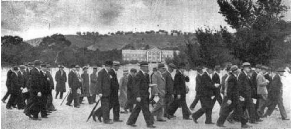
Figure 4: Visit to the Waite Arboretum by the Tree Planters Association and representatives of 23 District Councils.