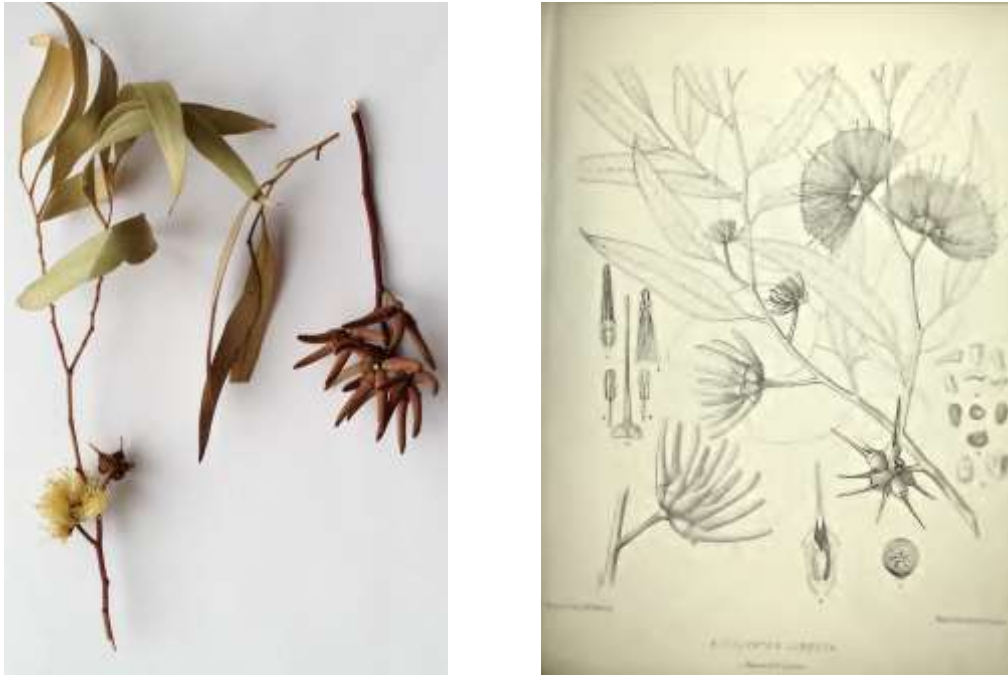
Figure 2(a): Specimen from Tree 51, Rotary Park (b) Lithograph from Mueller (1867:Plate VII).

forester and botanist, had given hope and were to be confirmed by substantial material on a fallen branch from Tree No. 51 (Ferguson 2013) on 21 February, 2013 – shown in Figure 2, together with the classification document from the Royal Botanical Gardens at Kew (Mueller 1867, Plate VII). That confirmation encouraged a search for further information about the origins of Rotary Park and of those trees in particular.