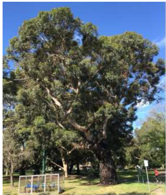
Figure 1. Yate trees in Rotary Park: a) No. 45, b) No. 51.