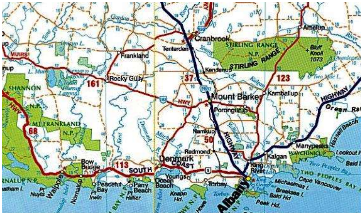
Figure 3: Map of South Coast of Western Australia.

This excerpt makes it clear that there were two possible occasions on which Mueller, an inveterate collector of specimens of new species, would have seen and possibly collected Yate, namely 1867 and 1877 (see Florabase in Department of Environment and Conservation 2013).