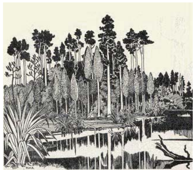
Kahikatea forest, Westland