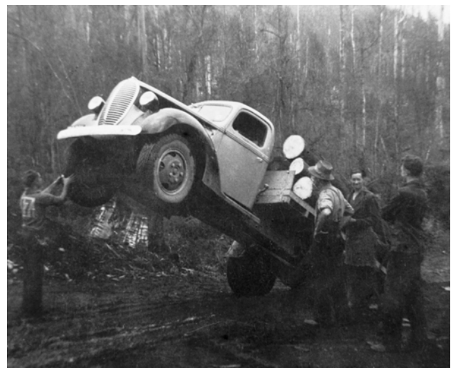
Above: 'One stick too many' – an overloaded timber truck at Feiglin's No.1 Acheron Valley mill (Victoria) in the 1940s.